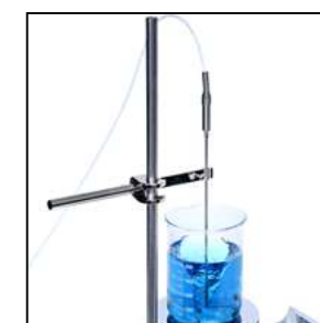
Support Rod and Clamp Kit