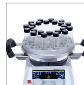
Base Plate and Handles