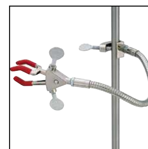
Ultra Flex Support Kit