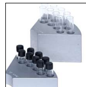
Vial and Test Tube Blocks