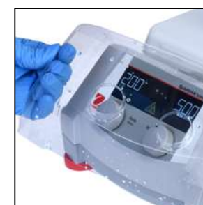
In Use Cover