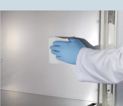
Wipe the inner chamber using a soft, lint-free cloth