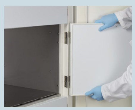
Remove inner doors for convenient cleaning