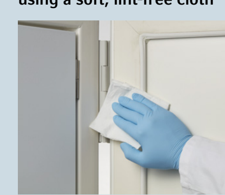
Wipe the outer door and its seal