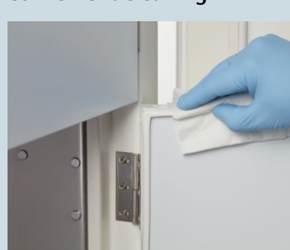
Wipe the inner doors and their seals