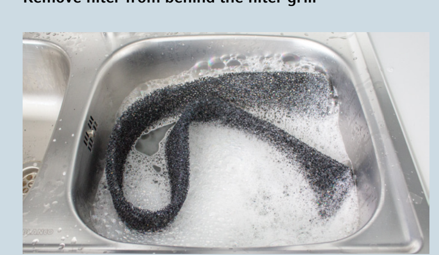
Wash the filter with a mild detergent