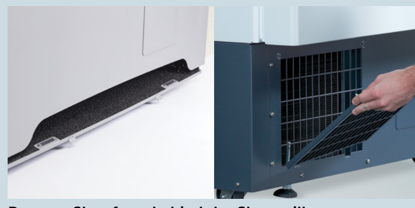
Remove filter from behind the filter grill