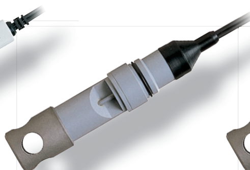
9551-20D For field immersible type (2 m cable)