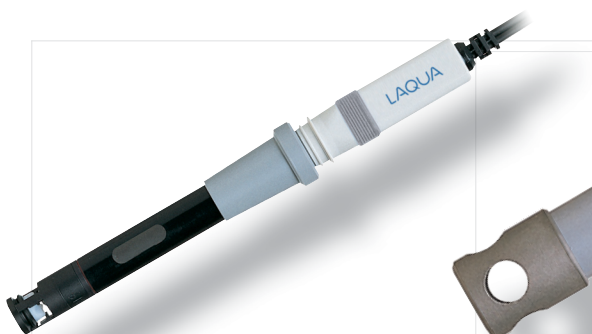
9520-10D For laboratories