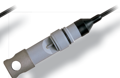
9551-100D For field immersible type (10 m cable)

HORIBA Instruments (Singapore) Pte. Ltd. 83 SciencePark Drive, #02-02A, TheCurie, Singapore118258 Phone: 65 6908-9680 Fax: 65 6745-8155 www.horiba-laqua.com e-mail: laqua@horiba.com