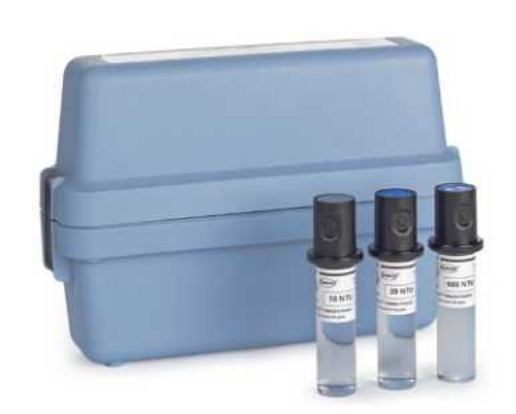
TU5 Calibration Vials

To maintain the 150 measuring points, staff carried out a scheduled cleaning, maintenance, and calibration service using a van equipped with spare parts, reagents and calibration standards. The maintenance and calibration were quantified at 4.5 hrs./instrument/year – not including nonroutine maintenance.