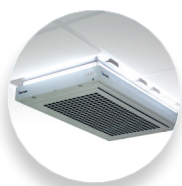
Simple to use and operate

Demand the best, industry certified, filtration quality