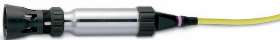
4-pin conductivity electrode, rugged design, with 5, 10, 15, 30 m cable