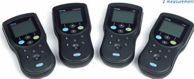
HQ 40D multi for pH, conductivity, oxygen, ISE—2 measurement channels