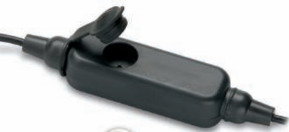
Memory chip with sensor cap calibration data

Each LDO sensor cap is supplied ready to use, including a memory chip. You are alerted automatically when the annual replacement is due