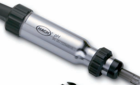
Outdoor electrode in rugged, waterproof (IP 67) design, impact protection can be removed for cleaning purposes