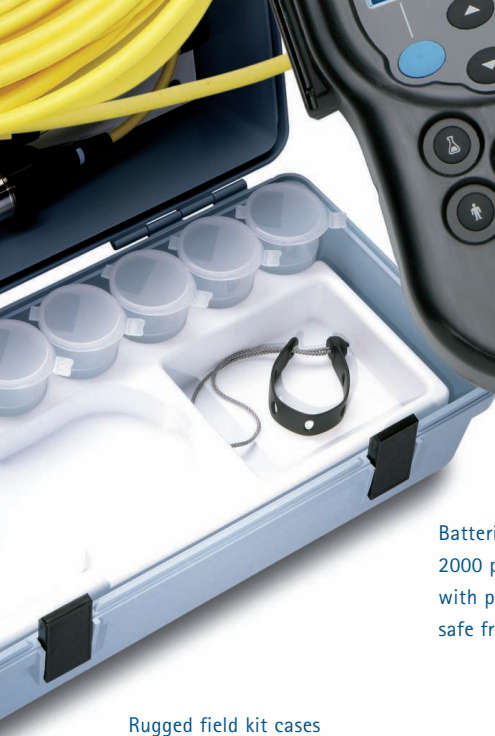
Rugged field kit cases