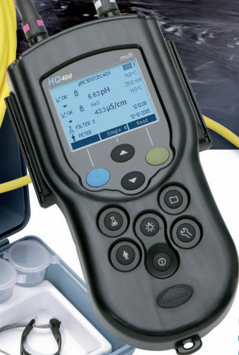
HQ 40D multifunctional meter—waterproof (IP 67), with continuous protective grip made of nonslip rubber

Batteries for more than 2000 pH readings—with power-economy mode, safe from data losses