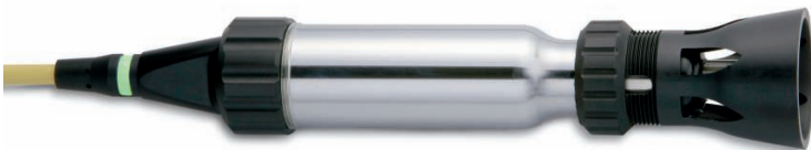
LDO sensor, rugged design, with 5, 10, 15, 30 m cable